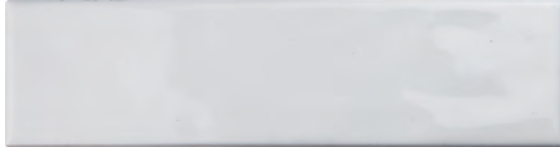
7,5 x 30 cm (3" x 12") BIJOU GLOSSY White