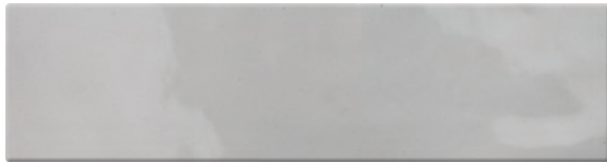
7,5 x 30 cm (3" x 12") BIJOU GLOSSY Silver