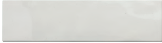
7,5 x 30 cm (3" x 12") BIJOU GLOSSY Bone