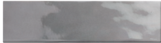
7,5 x 30 cm (3" x 12") BIJOU GLOSSY Grey