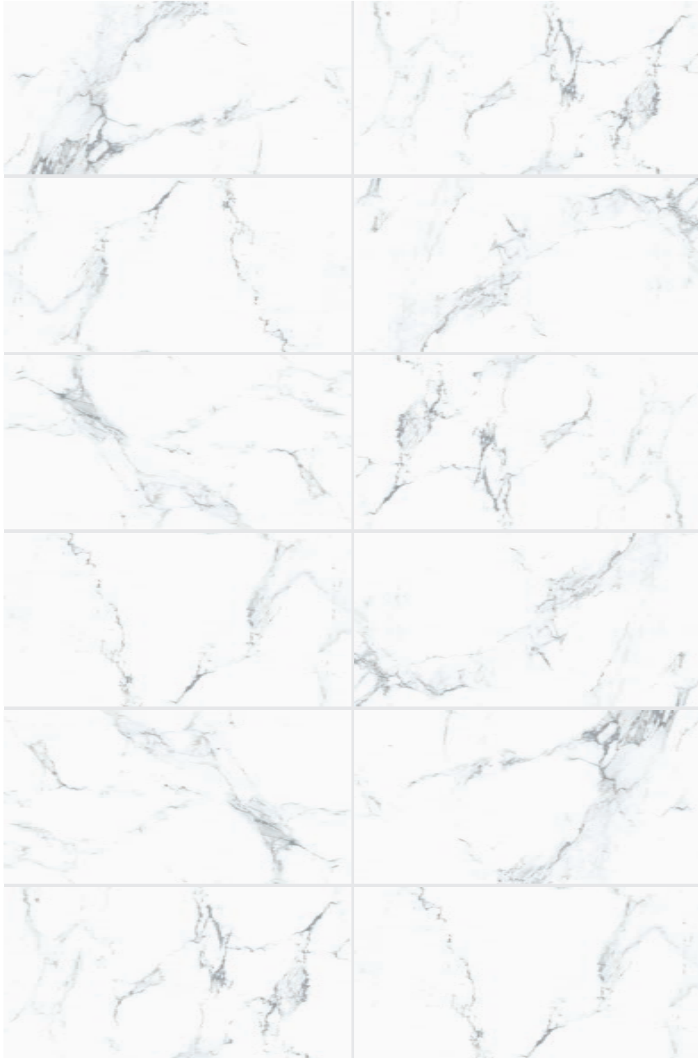
30 x 60 cm (12" x 24") STATUARIO BIANCO