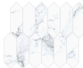
5x15 (2" x 6") 28 x 33 (11" x 13") STATUARIO BIANCO Picket Mosaics