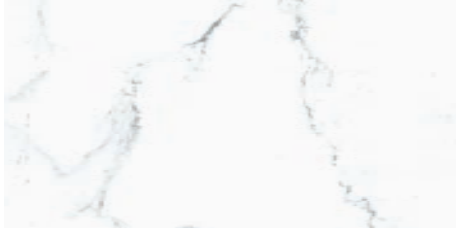
30 x 60 cm (12" x 24") STATUARIO BIANCO