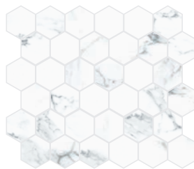
5 x 5 (2" x 2") 28 x 33 (11" x 13") STATUARIO BIANCO Hexagon Mosaics