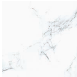
33 x 33 cm (13" x 13") STATUARIO BIANCO